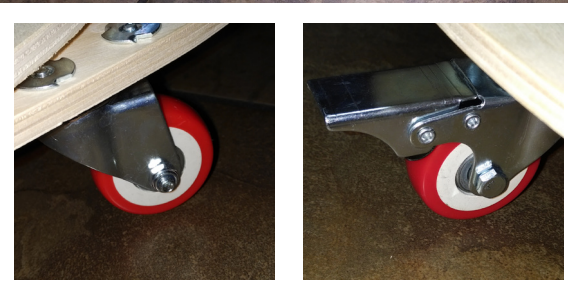
Features 3 Caster Wheels (with one break lock)