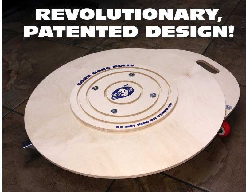
9mm (7-ply) Birch Wood Construction (24¾" x 21¾" x 3¾") on 3 Caster Wheels