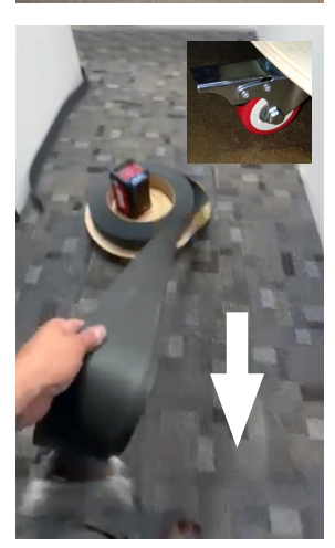
Or, lock the DOLLY in place and spin the cove base product down the length of your installation!