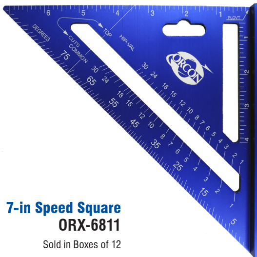
7-in Speed Square ORX-6811 Sold in Boxes of 12

Rafter or Speed Squares measure and lay out straight, 45° angled, and 90° angled lines. The flanged edge sits against a workpiece edge to check whether materials are square and to anchor the tool when marking lines. The flanged edge also provides a pivot point to measure and mark a range of angles. Their diagonal leg assists with marking rafter, trim, and stair angles. They are also used with plumb bobs when finding pitch on roof rafters and marking level lines along a plumb line.