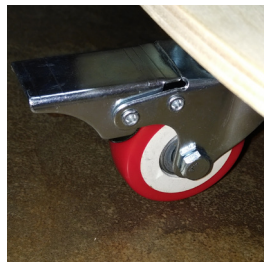
Features 3 Caster Wheels (with one break lock)