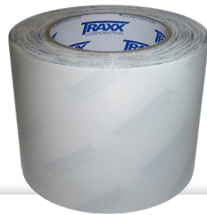
4 Inch Double-Sided Tape Part TSU-40200-DST4