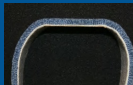
With Fusion™ System