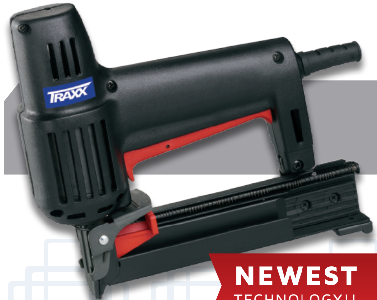
Part No. TTX-PP5418

Engineered with a fiberglass-impregnated composite housing, the TRAXX 5418 brings you tremendous impact resistance. And, its bumper design dissipates recoil when driving staples for total user comfort.