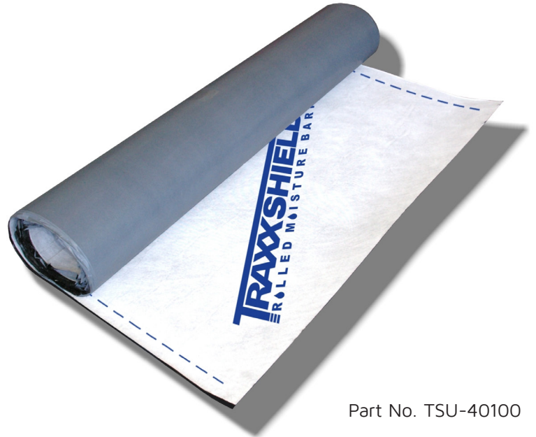
Part No. TSU-40100

Roll Size: 33'x66' Roll Sq. Ft.: 200 Sq.Ft. Roll Weight: 54.2LB Thickness: 42 Mil Application Temperature: 65 – 95°