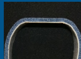
Using Fusion™ System